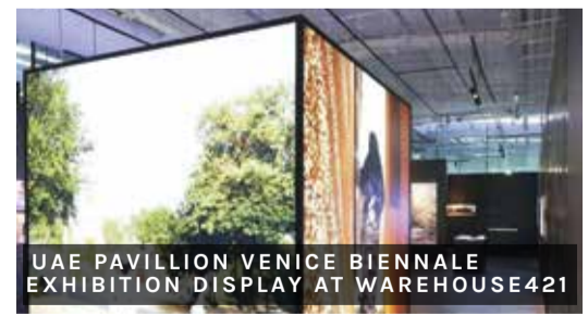
UAE PAVILLION VENICE BIENNALE EXHIBITION DISPLAY AT WAREHOUSE421

The mission of the Salama bint Hamdan Al Nahyan Foundation is to invest in the future of the United Arab Emirates by investing in its people. To that end, the Foundation develops and supports strategic initiatives in the areas of arts, culture & heritage, early childhood development, and health. Through its art, cultural and heritage initiatives, the Foundation supports emerging artists and others seeking a career in the arts sector in developing their skills and talents, builds new audiences for arts and culture, connects Emirati artists with international audiences and supports innovative efforts to preserve and share the nation's cultural heritage. In the programmes of support that The Salama bint Hamdan Al Nahyan Foundation is developing - be it their fellowship programme for emerging artists, the internship programme at the Venice Biennale, or others, The Salama bint Hamdan Al Nahyan Foundation seeks to support residents of all nationalities in the UAE and try, where appropriate to link the beneficiaries of their arts programme not only across groups within the UAE but internationally. Her Highness Sheikha Salama bint Hamdan Al Nahyan is the wife of His Highness Sheikh Mohamed bin Zayed Al Nahyan, Crown Prince of Abu Dhabi and Deputy Supreme Commander of the UAE Armed Forces. Salama bint Hamdan Al Nahyan holds the position of Founder of the philanthropic foundation that bears her name and is the Chair of Abu Dhabi Art Host Committee.