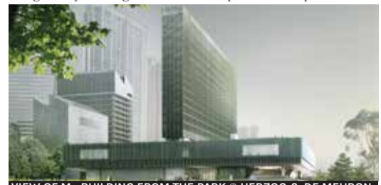
VIEW OF M+ BUILDING FROM THE PARK © HERZOG & DE MEURON COURTESY OF HERZOG & DE MEURON AND WEST KOWLOON CULTURAL DISTRICT AUTHORITY

West Kowloon Cultural District is one of the largest cultural projects in the world. Its vision is to create a vibrant new cultural quarter for Hong Kong. Comprising 40 hectares, the District will include complex of theatres, performing arts venues, public open space and museums. The flagship museum of 20th and 21st century visual culture, M+, designed by Herzog & de Meuron is planned to open in 2020.