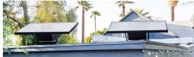
Single Family Homes