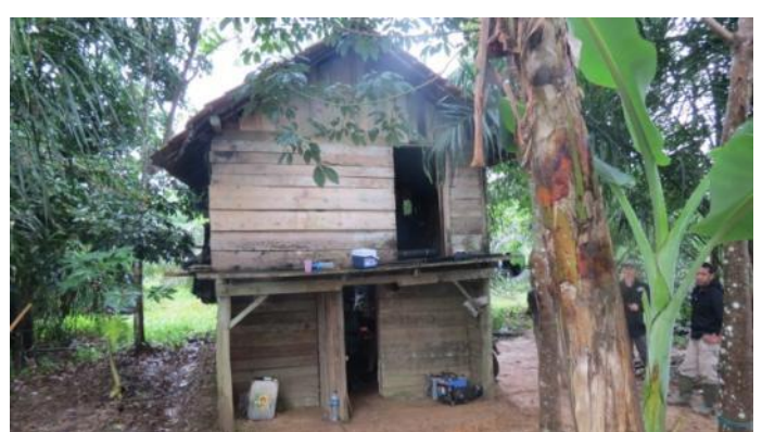
The wooden shack

A simple camp consisting of a two storey wooden shack and an area under canvas provided the base for trapping operations in northwest Dangku Reserve by the 15 person team commencing 20-Mar-13. The base was situated 3kms north of the reserve.