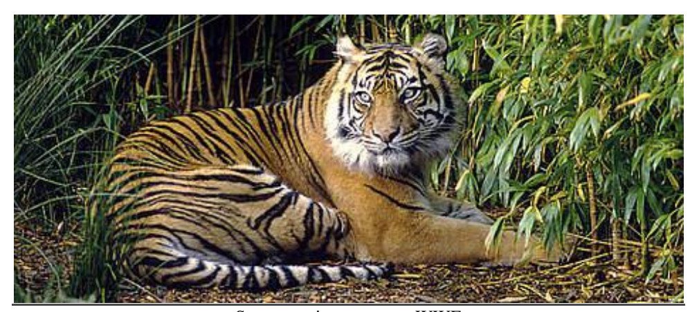
Sumatran tiger