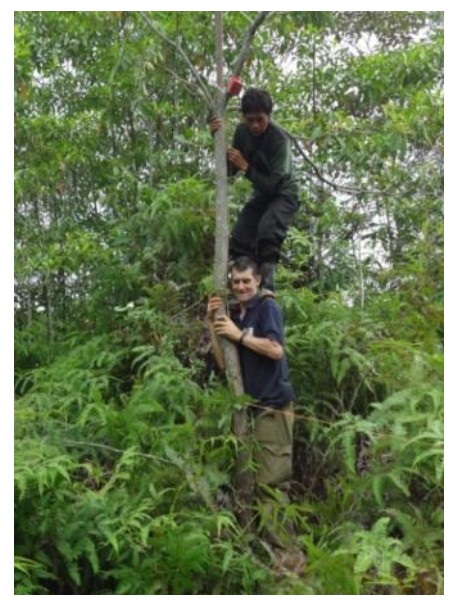
Installing the trap transmitter