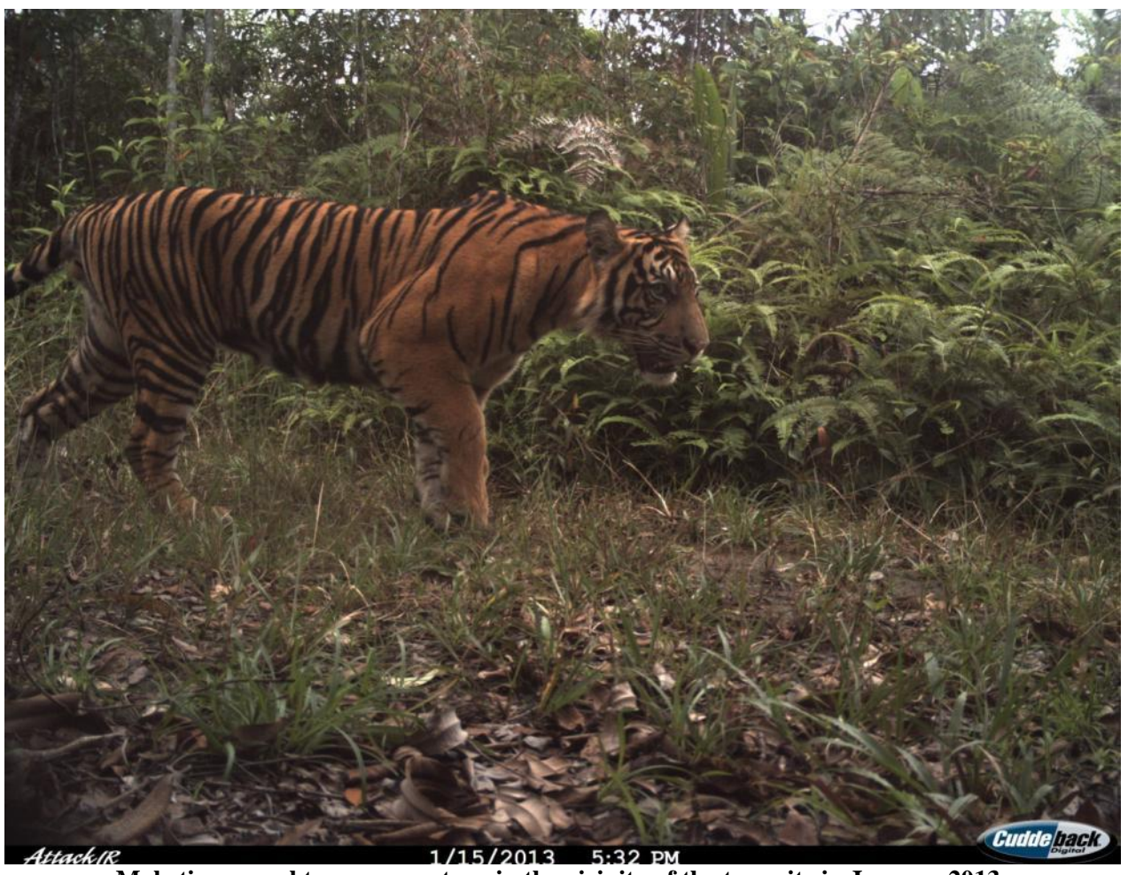
Male tiger caught on camera trap in the vicinity of the trap site in January 2013

Habitat corridors between small tiger conservation areas certainly have the potential to connect small otherwise isolated populations of tiger to others making viable metapopulations. However, they can also pose disease risks to tigers as they pass through – especially where human settlements in the corridor zones are accompanied by dogs which can be a source of potentially fatal viral infections for tigers. Tigers are often attracted to dogs as easy prey, and virtually all rural human settlements in Sumatra have dog populations. Discussions were held with ZSL-Indonesia highlighting the need to conduct disease risk assessments for any corridors linking Dangku to other area of tiger habitat.