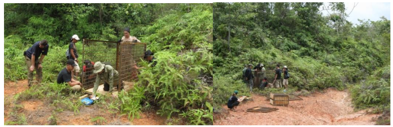
Setting up the box-trap