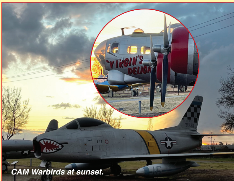
CAM Warbirds at sunset.

Looking ahead to the upcoming Spring we have our Memorial Day Open Cockpit Day on May 30! We should have two of our newly acquired Helicopters out on display by this date! Please keep checking our website along with Facebook and Twitter postings for the latest developments!