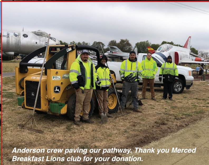
Anderson crew paving our pathway. Thank you Merced Breakfast Lions club for your donation.