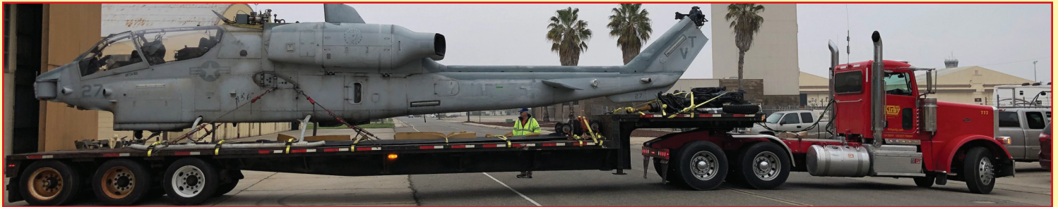
AH-1W Cobra arriving courtesy of Pasha Hawaii Shipping and Kirby Mfg. of Merced.