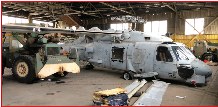
Sikorsky SH-60 Seahawk in restoration.

This Fall and Winter we had true pieces of history on the move from Oahu to Castle Air Museum. We obtained a Sikorsky SH-60 Seahawk Naval Medium Utility helicopter and a USMC Bell AH-1W Cobra Attack Helicopter; both will soon be on display. On the way are a Sikorsky CH-53 Heavy-Lift Transport helicopter and a Sikorsky UH-3 Sea King. These aircraft will join our UH-1V Iroquois and CH-47 Chinook and will bring collectively a group of helicopters into our “Wagon Wheel” area located in a highly visible corner of the museum. We found that in this location few visitors or passersby were taking the time to visit the area of the museum. They were either in too big of a hurry, or after a long and enjoyable day with our other aircraft artifacts, passed by suffering from “museum fatigue.” What a missed opportunity for us not to be able to share some very significant pieces of history relevant to tens of thousands of Airmen, Soldiers and Marines. During the Winter we relocated some aircraft artifacts and are creating a wonderful historical helicopter display.