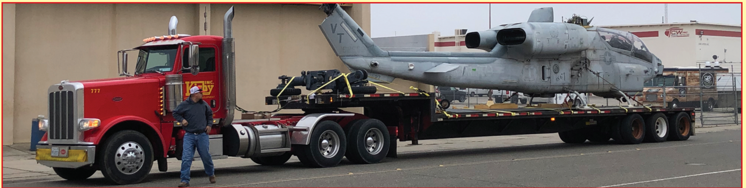
Another view of the AH-1W Cobra arriving.