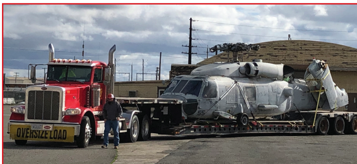
SH-60 arriving courtesy of Pasha Hawaii Shipping and Kirby Mfg. of Merced.

You have heard “They just don’t make small airplanes anymore” and finding an exhibit footprint here at Castle Air Museum is getting tougher, but we are a strong staff. We’ve alluded in the past that a Lockheed F-117 Nighthawk Stealth Attack aircraft is in our future. The future is here, and we are expecting the aircrafts arrival before the Winter. Storage and then reassembly will be two major efforts on the part of our restoration volunteers. It is a big, impressive aircraft and will be a remarkable addition to the museum collection and assist in telling the story of Stealth Technology and the F-117 Nighthawks involvement in our nation’s conflicts.