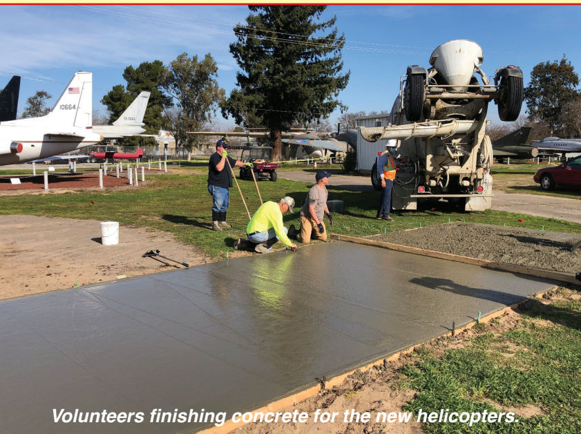
Volunteers finishing concrete for the new helicopters.