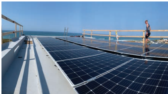
December 2019. 30 panel installation on a large residential home in Papamoa with double glass frameless panels.