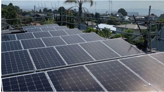
December 2019. 31 panel tilt mounted installation on Mt Maunganui residential home.