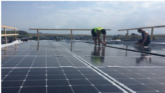
December 2019. 30 panel double glass frameless panel installation on residential Papamoa home.