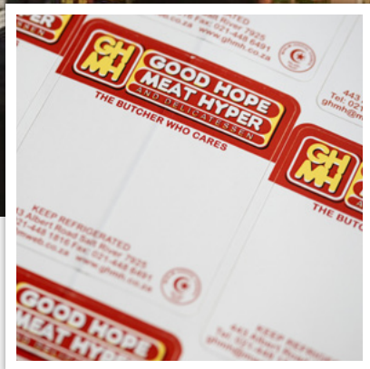
Customised Food Labels