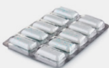
TAGIT EM labels work on aluminum blister packs

Eben Singleton | SPAR Supermarket Store Manager