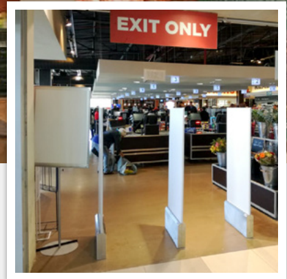
Exit Protection (can be branded or used for ads)