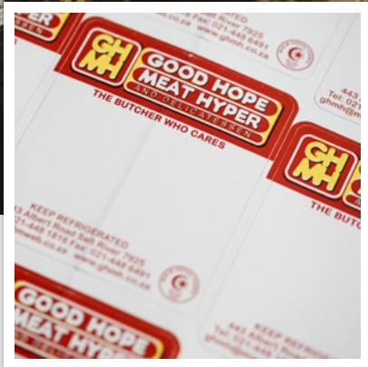
Customised Food Labels