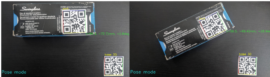
Fig. 3. Use of two QR codes for locating parts of different positions and orientations.

is crucial to ensure the adhesion is good. In this application, we let the machine print a QR code as the adhesive layer. Using fiducials made by the 3D printer allows the vision system to see what is happening. Figure 2a shows a 2'' \times 2'' QR code printed on the build plate, and it only takes a few minutes to print the code. If it is in good shape (Fig. 2b), the vision engine can read it from over one meter away. Otherwise, if the vision engine does not recognize the code, there is a high probability that the layer is not adhering (Fig. 2c), and the system will pause the process and send out an alert. Making “structures with messages” on a 3D printer is important because it shows that the use of fiducials needs not to be an external operator-drive event. Our manufacturing process itself can create a feedback mechanism that the vision system can see and evaluate in real time. We can engineer quality into the production process, which can also assess production milestones, audit production, and run unattended operations to enhance throughput.