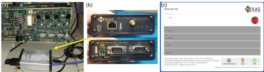
Fig. 1. (a) Nexas ORiON Production Interface (OPI) installed in CNC machines. (b) Front and back view of the OPI. (c) Web interface of the OPI.

machines, we have designed and developed the ORiON Production Interface (OPI), which is a small box ( 5'' \times 4'' \times 1.5'' ) to be embedded in the CNC machines (see Fig. 1). In terms of computational power and memory, the OPI has a Linux-based hardened Quad Core 32 bit ARM processor, 512 MB DDR3 RAM, and 16 GB internal SD flash drive. In terms of connections, it has a Gigabit Ethernet port and 802.11 B/G/N Wi-Fi connection, so that it can connect to the Internet through Ethernet cable or Wi-Fi, and any browser can talk to the OPI using a laptop, a tablet, a smart phone, or an iOS device. It also has a dual RS-232 DB9 serial port, and it can connect to the CNC machines using serial cables for direct numerical control (DNC). In addition, the OPI has a couple of universal serial bus (USB) ports, and this work uses them for a camera. As a result, acting as a file storage and embedded DNC engine, the OPI is a simple, economical adapter that enables USB and serial DNC links to the CNC machines, making them compatible and online.