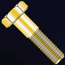
HEX CAP SCREWS