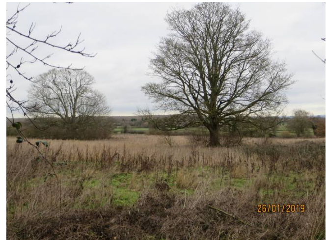
Viewed looking east over site

1.8 This potential Local Green Space serves which community. Single track road from Burbage village centre and public footpath runs along the southern edge of this site.