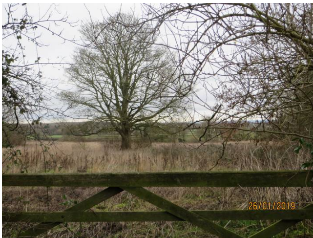
Entrance from Aston Lane gate.