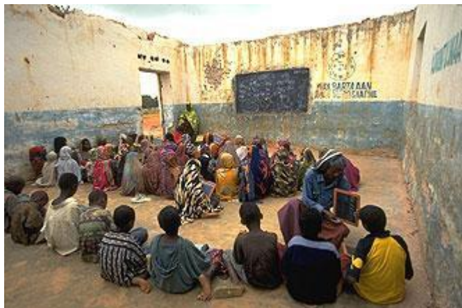
In the south-central town of Baidoa in Somalia, first grade students sit on the floor in a roofless building because their school has too many students to fit everyone in the main building.