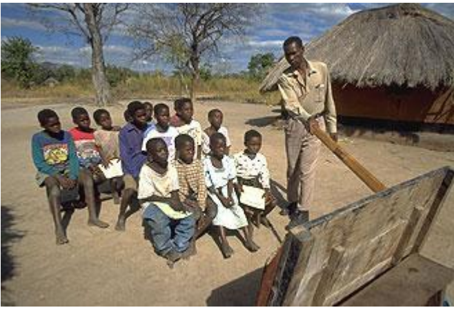
Children sit outside on benches as their teacher points to a chalkboard during a mathematics class at a community school in the village of Nkausu, near the town of Ndola in central Zambia.