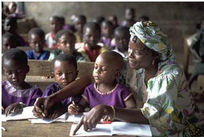
In Nigeria, three small girls seated at a shared desk are helped with their schoolwork in a primary school class in Ibadan, capital of the south-western state of Oyo. Their school has four walls, a roof, and rooms for each class.