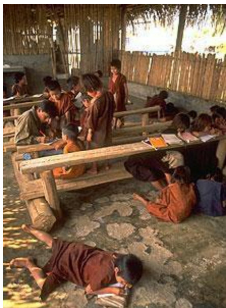
Children from the Ashaninka indigenous group sit at desks made of logs, or sit or lie on the floor while studying at the Cutivireni mission school in the central department of Junin, Peru.