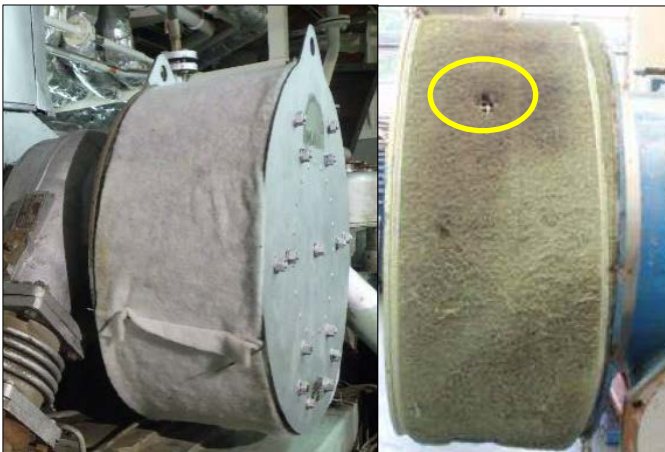
Figure 1: Non OEM air filter mat.

Field experience has shown that in some cases non OEM air filter mats are fitted to the silencers of TCR turbochargers. These air filter mats are made of a less resistant material than MAN OEM air filter mats. A possible dissolution of the mat fibers may cause severe damage to the turbocharger. Fiber parts can be sucked in and may cause damages to the compressor wheel and consequently to the engine. In addition, foreign objects can enter the silencer since the filter effect is no longer given – see figure 1 .