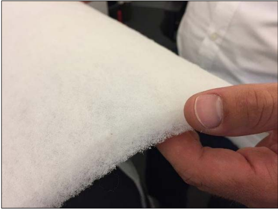
Figure 2: MAN OEM air filter mat (544.201).

The MAN OEM air filter mat is made of a progressively structured synthetic random fiber fleece, which is resin-bonded and specially adapted to its application.