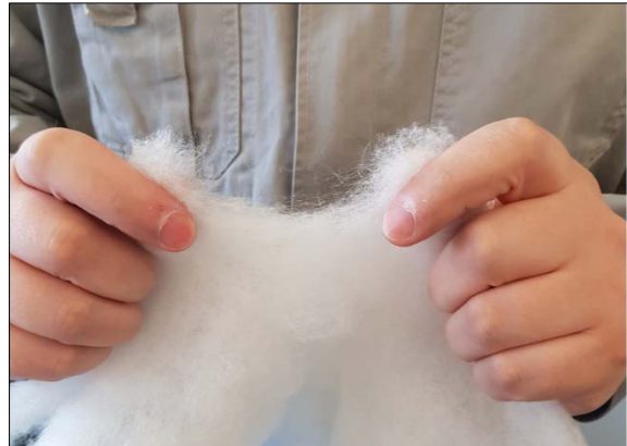
Figure 3: Less resistant non OEM air filter mat.