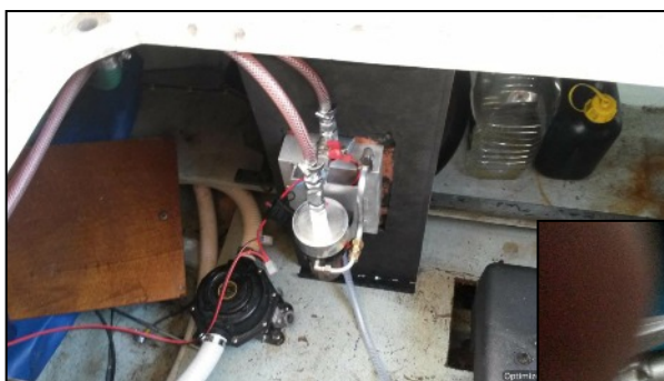
Diesel Dipper® installation