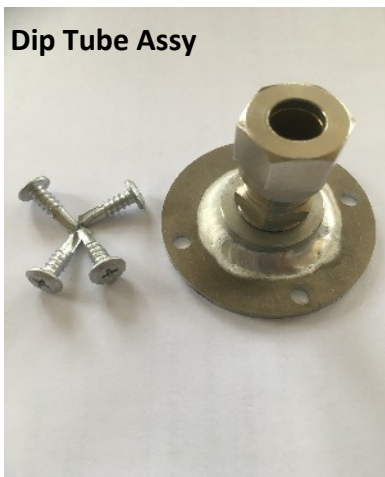
Dip Tube Assy

For tanks without a drain, we recommend fitting our Dip Tube Assembly to the top of your tank.