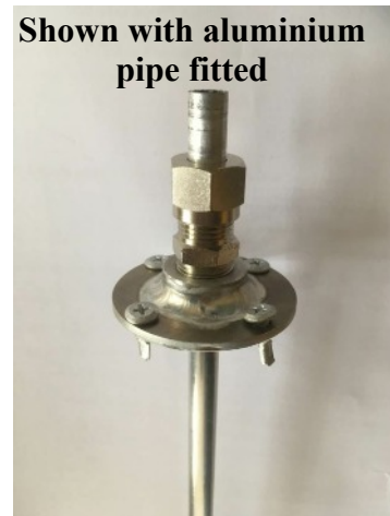
Shown with aluminium pipe fitted

RIGHT: The flange is designed to take a length of aluminium tube 10 mm o/d, 8 mm i/d. Available from your local hardware/DIY Store or MarShip® supply in 1 metre lengths as an optional extra.