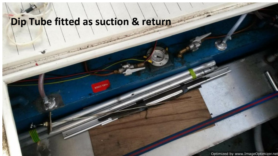
Dip Tube fitted as suction & return

Above: Shows the dip tube assy fitted to the top of the tank, a tube passes through the fitting to suck from the VERY BOTTOM of the tank