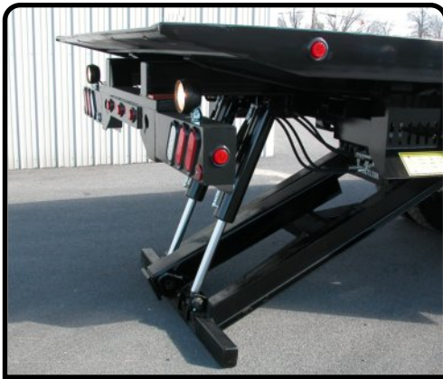
• Hydraulic Stabilizer Bar with Pintel Hitch