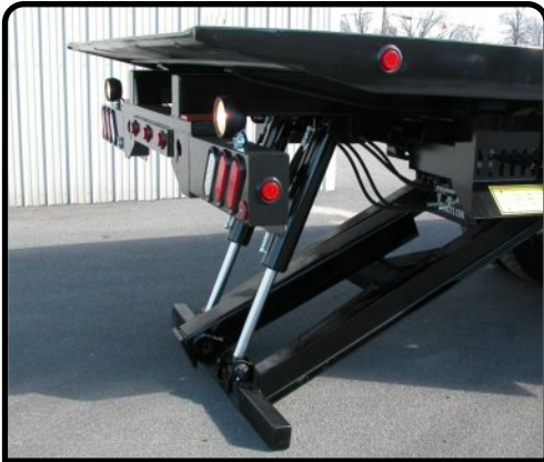
• Hydraulic Stabilizer Bar with Pintel Hitch

IMPORTANT: Gross vehicle rating limitation must be considered. Ratings are based on structural factors only, not chassis capacity. Danco's body ratings are based on a water level capacity. Danco specifications shown are approximations and may vary depending on chassis selected. Prices and product specifications are subject to change without notice. Consult with state and local laws for the maximum vehicle lengths allowed. Optional equipment may be shown in photographs and may not be part of the standard package. Optional upgrade prices not included in standard pricing. See dancoproducts.com for a more complete list of specifications. * Optional upgrade prices not included in standard pricing. All prices are installed, Freight on Board Greencastle, PA