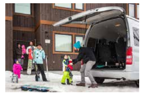
6.0 SKI AND SNOWBOARD LESSONS